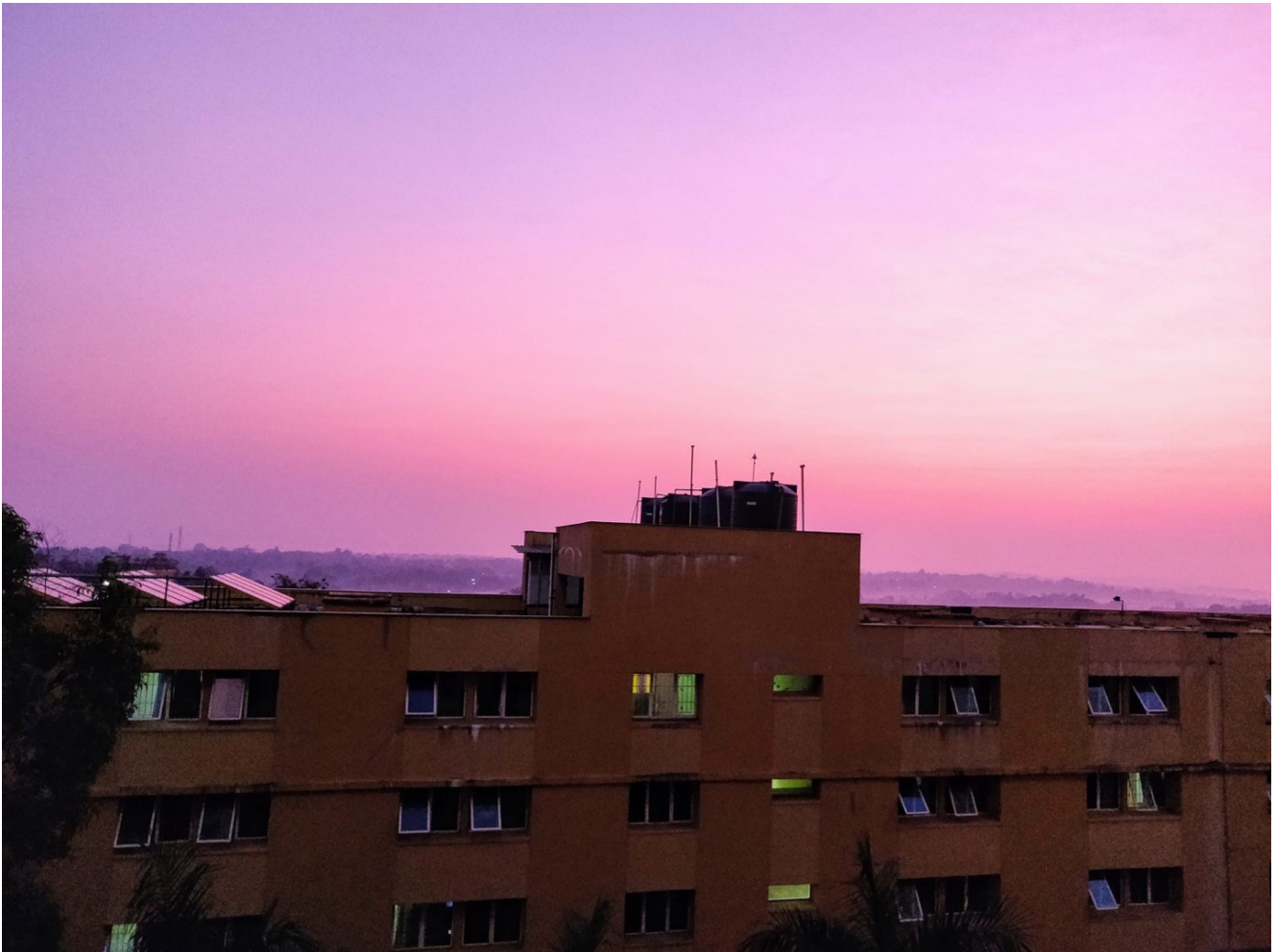
The view from Block 16.

with the freshers but they hardly ever give anyone a difficult time aside from imposing the perm. The seventeenth block, however, has the most relaxed and friendly caretakers. While an 'in-time' might seem like a frustrating rule, especially with the freedom allowed in all other aspects of the college, it is there for a reason and only serves to safeguard the student populace.