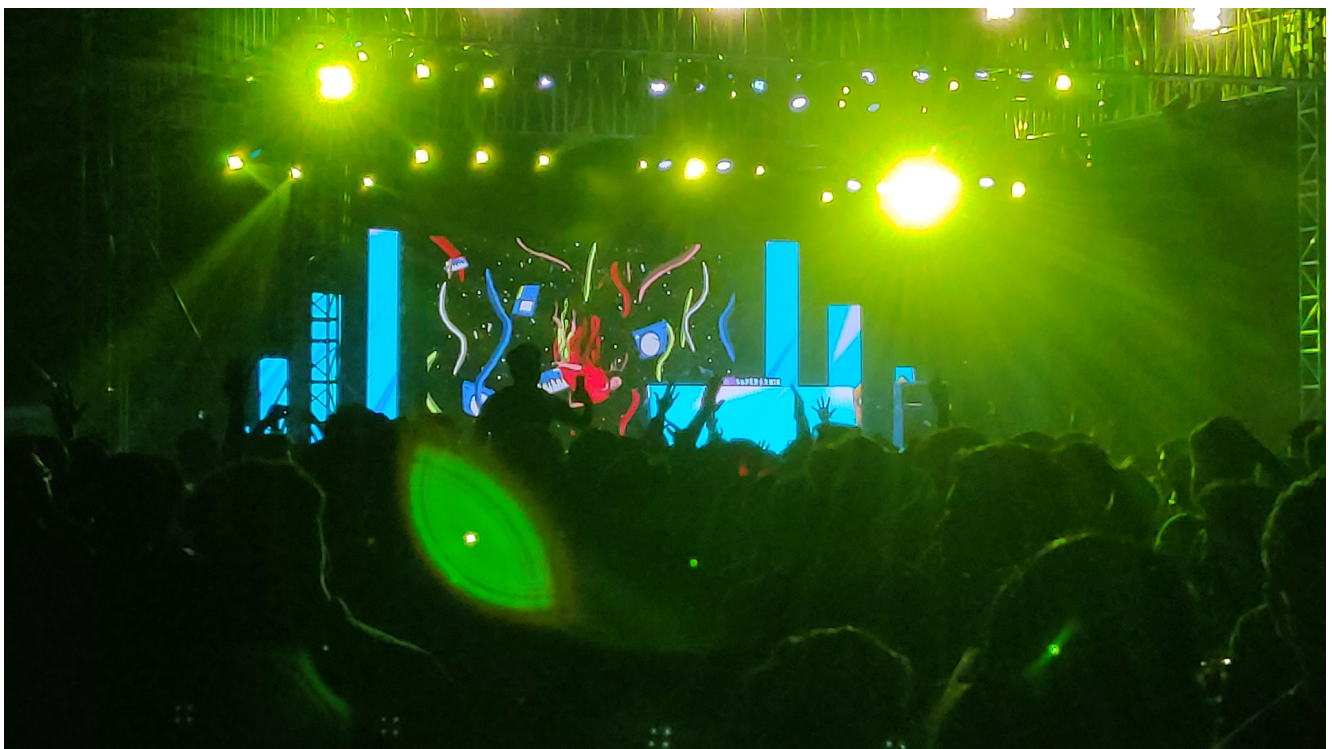
Ritviz performing at Revels '19.

people that make a place truly memorable and some of my cherished memories are not around the town itself, but all the friends I made. I remember one unfateful morning when a close friend had to rush uphill to the academic block in a record 8 minutes to make it in time for a lecture, failing which, he would have had to drop the course. We had stayed up late into the night (morning, rather) playing Fifa, and the sorry soul had to brush in the lecture hall's washroom the next day. A video of him caught in the act made rounds on Whatsapp all through the following week. My roommate and I were conspirators of another such marvellous display when we made the climb to the Academic Block in under twelve minutes to save our semester. Needless to say, we were both in our pyjamas and were fresh out of our beds. Neither of us remembers what lecture we had that morning, nor do we recall what was taught that week; but the image of us trying to scramble up Temple Run in our slippers will be with us for a long time.