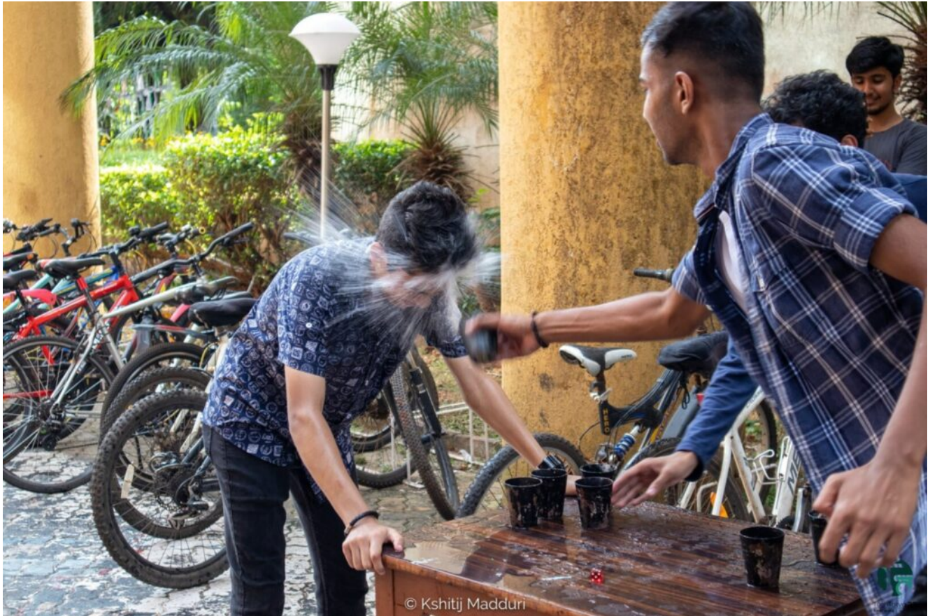
Students playing a game of In-Your-Face during TechTatva'19.

even if one isn't interested in the technical events, there's always the option of getting your photos clicked, tucking into a juicy roll, or even playing an exciting game of In-Your-Face.